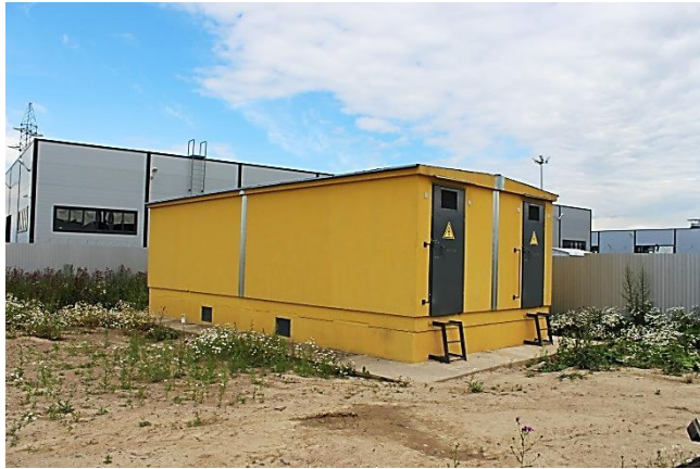
Electric substation - 10 mWt